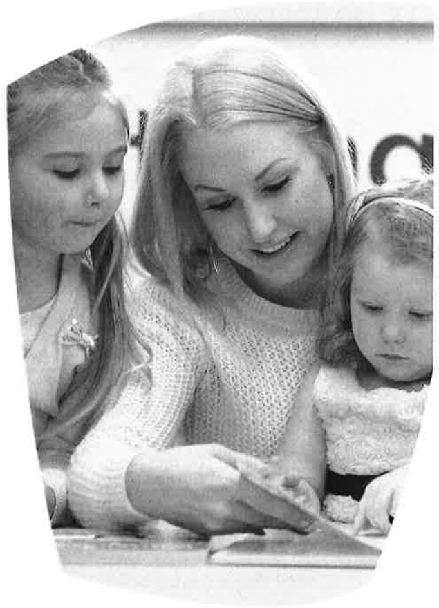
The community came to celebrate the opening of the new Sayward branch, which held its Official Opening on December 21.

The Board of Trustees is provided with updated reserves information at each meeting. At the end of December, the reserves stood at a balance of $6.2 million. Appropriations to reserves are recorded on a monthly basis. Year to date withdrawals consist of amounts for debt servicing and projects at Parksville, Sayward, Sidney, Sooke, Chemainus and others, as well as purchases of furniture and equipment, replacement of a delivery vehicle, and investments in IT software and hardware.