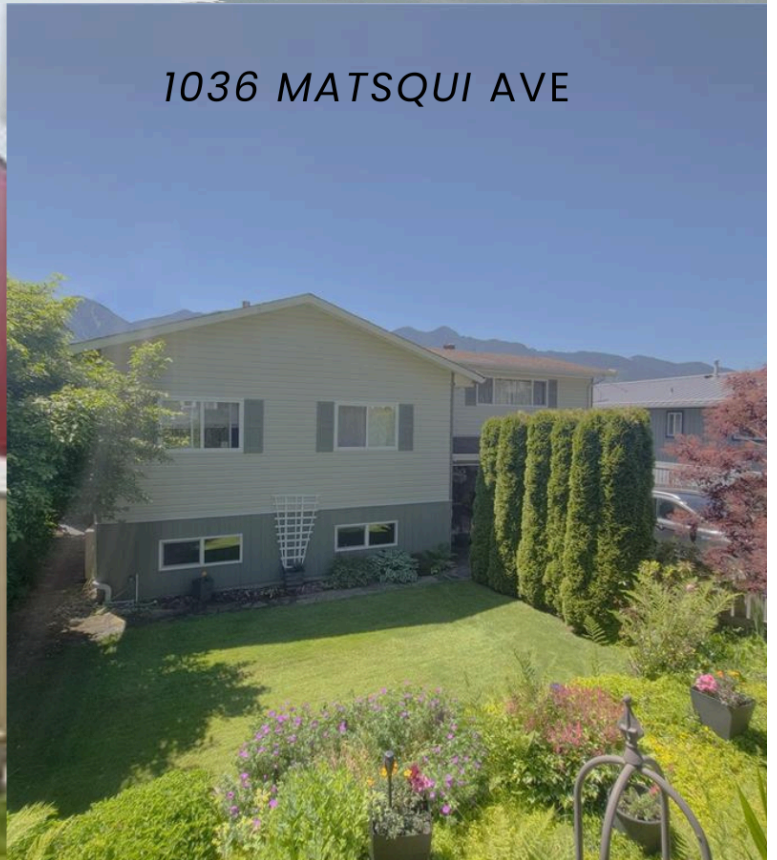
1036 MATSQUI AVE