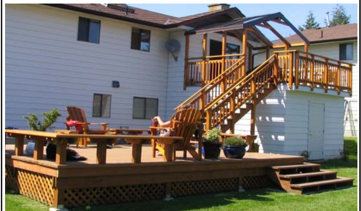
Multi-level Decks and Sunspaces